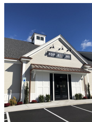
Forge & Vine Restaurant Groton, MA