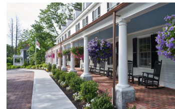
The Groton Inn, Groton, MA

Visit our project portfolio at: www.omniproperties.com to view all of our recently completed projects